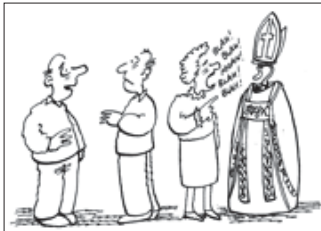
I haven't the heart to tell her the Bishop went home 20 minutes ago!

An inscription by Damasus says Protus and Hyacinth were brothers, and another ancient source called them 'teachers of the Christian law'.