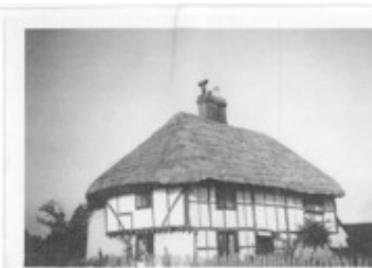
In the winter the wind would howl around the walls of Little Snoad

Summer is turning to Autumn, and Christmas is something that goes on and on in time and never changes. It is dependable. It is a time for everyone. Reminiscences for all. When my generation were young children, simple things gave us pleasure. Until 1953 rationing was in force, yet I cannot remember being deprived of anything. My Christmas stockings were always full of lovely things and there was always an abundance of food and Christmas goodies. It seemed always to snow at Christmas time, though I don't suppose it did. The wind would howl around the walls of Little Snoad Cottage, but we were warm and cosy inside, and the angry, noisy weather could not reach us. We had no need of expense and large presents, such as are on offer today. But family love and real friendship were the essence of Christmas. Secure in the knowledge that all was well, safe and companionable. Sadly, as time passes, these special people