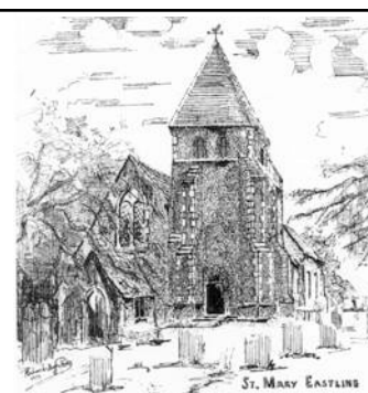
Drawings by Hugh Perks