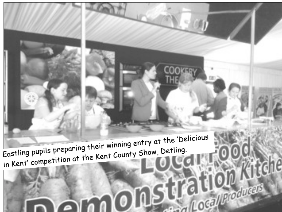
Eastling pupils preparing their winning entry at the 'Delicious in Kent' competition at the Kent County Show, Detling.

We're now starting our publicity to gain children for next year and have an Open afternoon on Thursday 13th October from 1.10-4.30pm. Please let anyone you know with 4 year old children know about our marvellous village school so that they can share in our favourable facilities and activities.