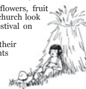
Edna was shattered after decorating the whole church for Harvest.