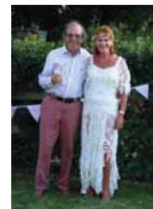
A GOLDEN WEDDING GIFT FOR STALISFIELD

The day was made of course, by the solid support of so many people who turned up with the intention of enjoying the occasion and who entered fully into the spirit of the fete.