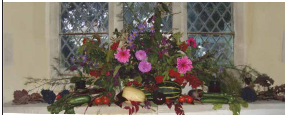
The news magazine for the parishes of Eastling, Stalisfield with Otterden, and Throwley

This year the proceeds will be split between the pensioners' Christmas lunch and the Eastling Youth Club