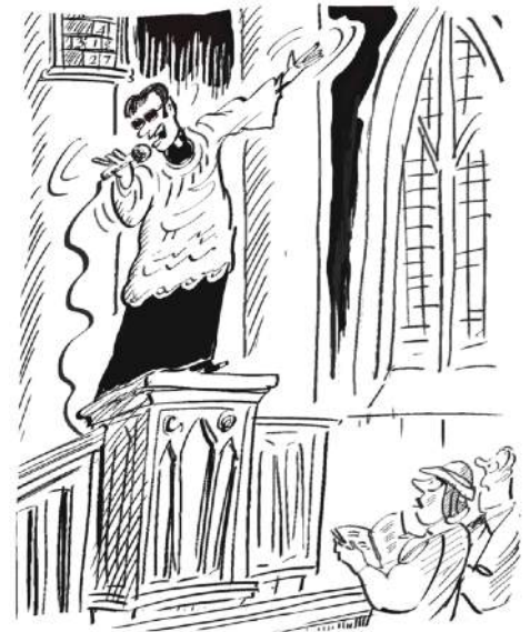
The vicar got a little carried away with the church's new state-of-the-art PA system