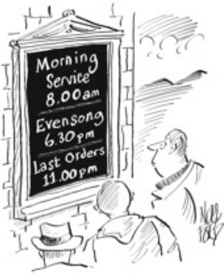
The vicar's alternative to traditional after-service coffee was having a dramatic effect on male church attendance

Friends of Suchana raises funds for excluded rural children in India specifically this year for classes at Suchana's Community Centre and Suchana's mobile libraries which regularly bring to remote villages: books in their own languages as well as Bengali, a teacher with fully charged laptops and a health worker.