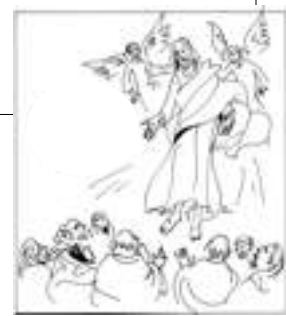
'While the Lord blessed them, he parted from them and was carried up into heaven.' Luke 24:51

25th May: Ascension Day 40 days after Easter comes Ascension Day.