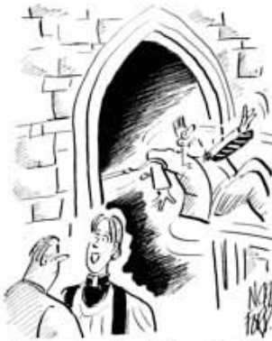
"We seem to get a much bigger turnout whenever the Bishop visits."