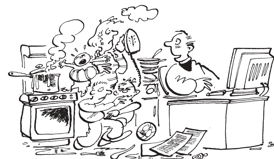
I'd love to help dear - but I really must finish this sermon... ...my theme's the '200th Anniversary of the Abolition of Slavery!'

In April, 1916, Daylight Saving Time was introduced as a wartime measure of