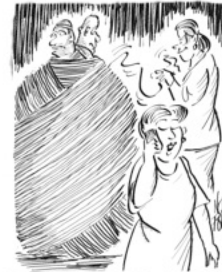
"Police? This is St Mary's Ladies' Knitting & Vigilante Circle. We've detained two gents trying to nick the church silver."

Please send your CV to info@theploughinnstalisfield.co.uk or pop in to see us,