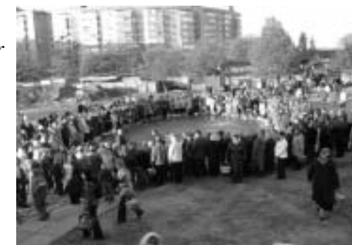
Orthodox christians gather to receive their Easter Bessing