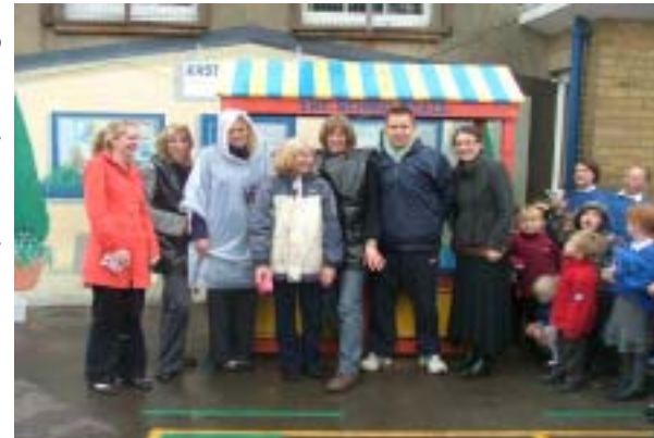
The staff line up for a splashing

Eastling pupils were delighted to help in the bid to raise funds for Cancer Relief by....