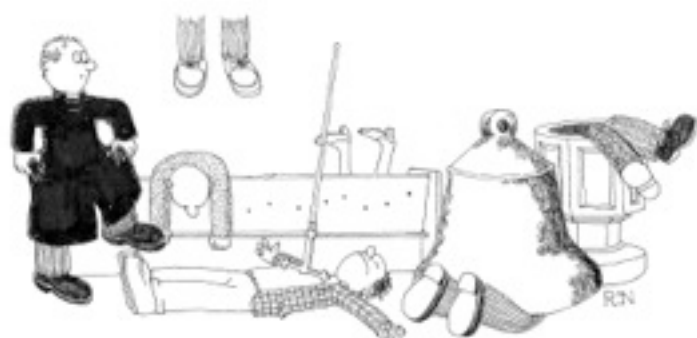
It was a normal Sunday Morning in Midsomer Parish Church

(BCP) Service taken from the Book of Common Prayer, 1662. (CW) Service follows Common Worship Liturgy, 2000.