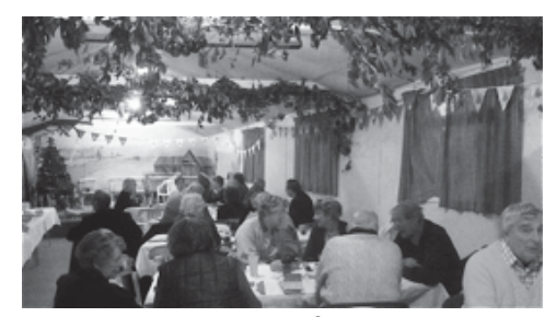
Stalisfield Highlife Over 60s Christmas Tea

Reports that the Stalisfield and Otterden over 60s would be treated to mince pies only this year, turned out to be only rumours. The village hall committee hoped for good weather and although the weatherman wagged a flaky finger on Friday he relented on Saturday with enough sunshine to melt residual snow. The decision by the Hut committee to go for a regular "Retirees Rave" complete with festive food, turned out to be justified and the tables were filled.