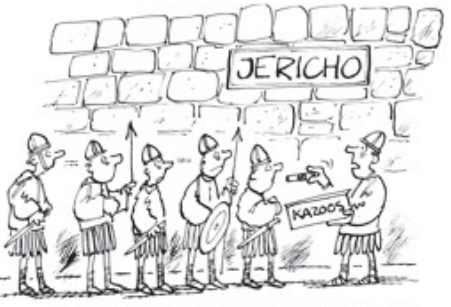
Joshua says he's very sorry - but it's something to do with the recent weapons procurement review.