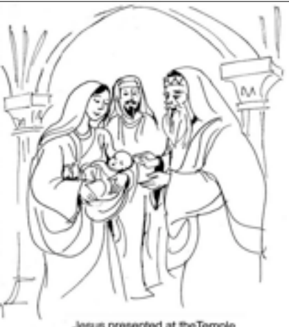
Jesus presented at the Temple

Waiting and Ready (Luke chapter 2, verses 25-35) Waiting for fulfilment of a promise, Waiting to see the longed-for light, Waiting in devotion of a lifetime, Simeon, trusting God to keep his word. Ready for the prompting of the Spirit, Ready for the revelation joy Mixed with cross-shaped shadows of the future, Simeon, holding Mary's God-filled boy. By Daphne Kitching