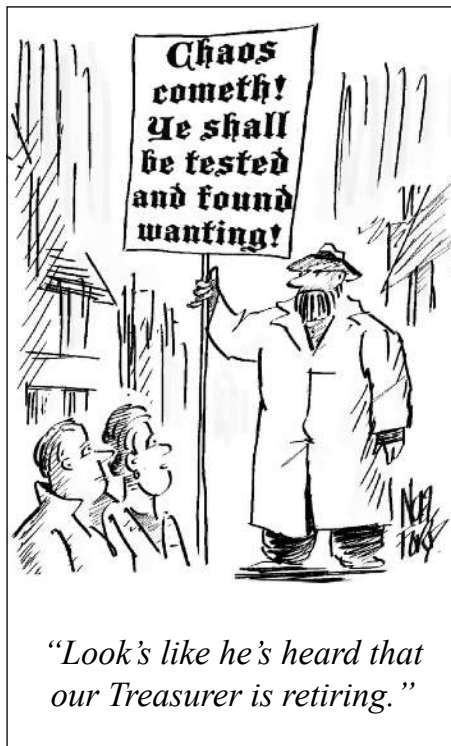
"Look's like he's heard that our Treasurer is retiring."