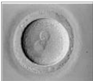
Human egg soon after fertilisation viewed using Nomarski optics. The two parental pronuclei are clearly visible and have not yet fused.

The transcendent God is also immanent, longing for us to relate to Him as Father. He became as fragile as we are so He could rescue us from the messes we so often find ourselves in. With His help, we can remember what it means to be fearfully and wonderfully made.