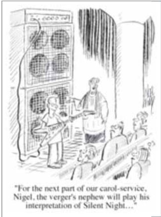
"For the next part of our carol-service, Nigel, the verger's nephew will play his interpretation of Silent Night..."

Violent games harm young minds When you choose Christmas presents for any youngsters this year, beware the violence that may well be lurking inside that computer game. Psychologists have expressed their real concern at the effect that games such as 'Grand Theft Auto', 'Mortal Kombat' and 'Call of Duty: Modern Warfare' could have on youngsters – making them more prone to violence. The Association of Teachers and Lecturers is warning that violent computer games can have a really damaging effect on children, desensitising them to aggression and bloodshed. Over-exposure to screen-based entertainment also robs them of valuable time interacting with friends or playing outdoors. As one leading teacher put it: "If children are up until midnight playing violent computer games, and then come into school exhausted, not interacting with their children, that is not good preparation for school, and not good preparation for life."