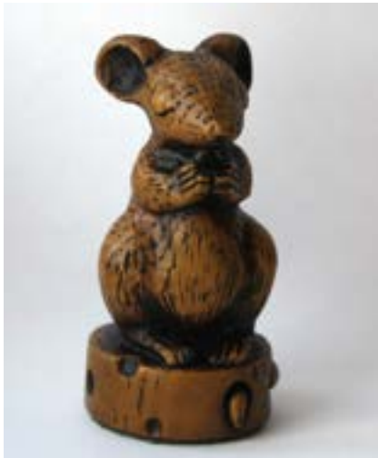
Church Mouse Praying on Cheese

Taken from the old saying "poor as a church mouse" this wonderful collection of Church Mice makes the most perfect collectable gift. Designed by ourselves at Oakapple Designs then fine detailed and carved by the Sculptor Nick Hunter. In our collection he comes with many guises and wears an outfit or costume for all his adventures behind closed doors within the church. £13.99 from Oak Apple Designs 01909 774532