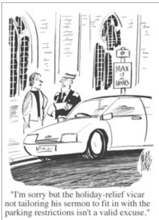
"I'm sorry but the holiday-relief vicar not tailoring his sermon to fit in with the parking restrictions isn't a valid excuse."