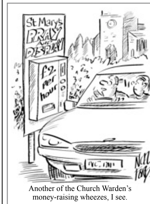
Another of the Church Warden's money-raising wheezes, I see.