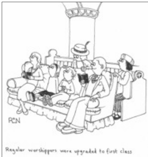
Regular worshippers were upgraded to first class