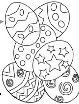
Easter Eggs to colour

Fridays 9th and 23rd April, 6.15 - 7.15pm Champion Hall, Painters Forstal. 50p per session Contact number 532756.